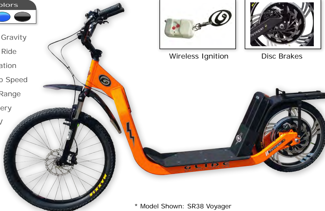
* Model Shown: SR38 Voyager