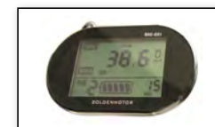
LED Computer Display